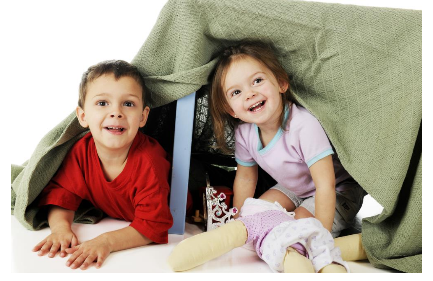
Creative Therapy for Children with Anxiety